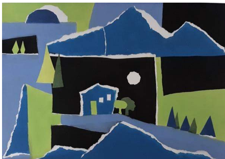
“Reminiscence” by Phyllis Meyer Acrylic Collage