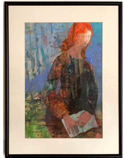
2 nd Place – Liz Walker